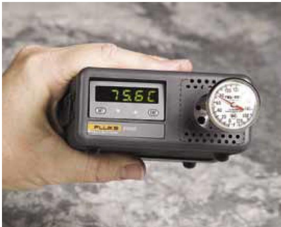
Temperature sensor calibration is easy with a handheld dry-well.