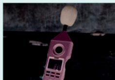
Sound Level Measurement