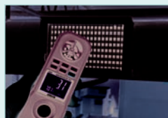
Air Velocity and Temperature