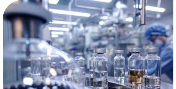
Process industries (chemicals, pharmaceuticals, cosmetics, etc.)