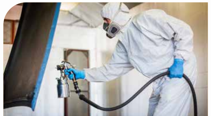
Industrial paint shops (automotive, rail, etc.)