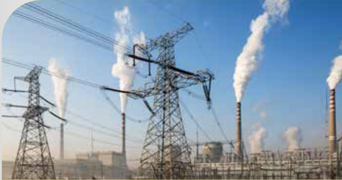
Electricity generation (coal-fired power plants, gas-fired plants, hydroelectric plants, etc.)

This multimeter guarantees excellent measurement reliability, electrical safety in your work and higher productivity in your activity.