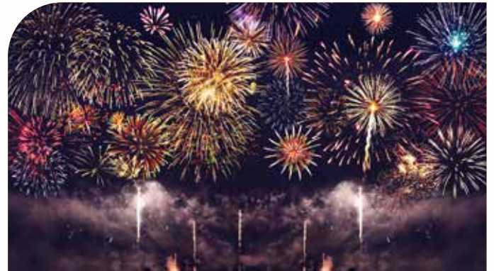
Arms industry and ordnance devices (explosives, gunpowder, etc.)