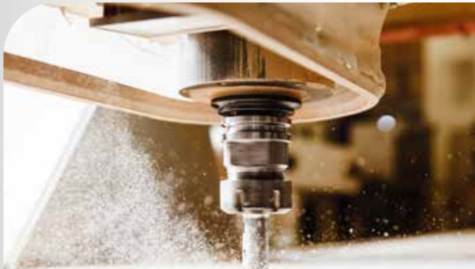
Processing industries (wood, metals, etc.)