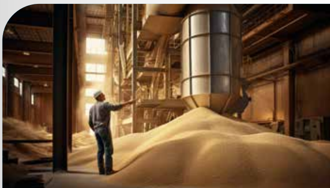
Agri-food industries (flour, cereals, etc.)