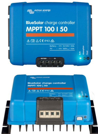
BlueSolar Charge Controller MPPT 100/50