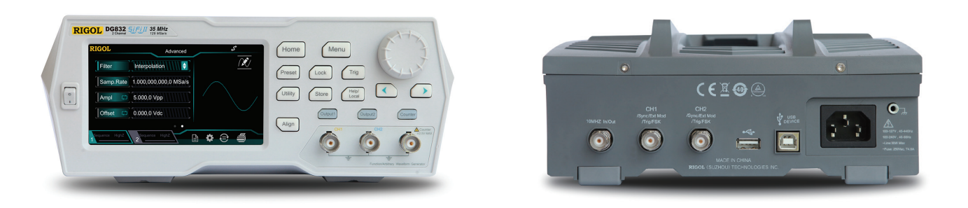
Dimensions: W×H×D = 237.4 mm × 97 mm × 268 mm Weight: 1.75 kg (Package Excluded)