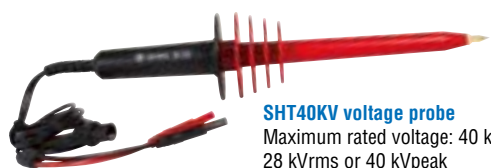
SHT40KV voltage probe Maximum rated voltage: 40 kVDC, 28 kVrms or 40 kVpeak Input/output division ratio: 1 kV/1 V