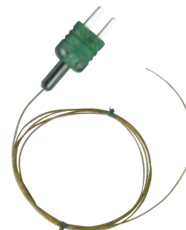
SK thermocouple For temperature measurement from -50° to +120° C